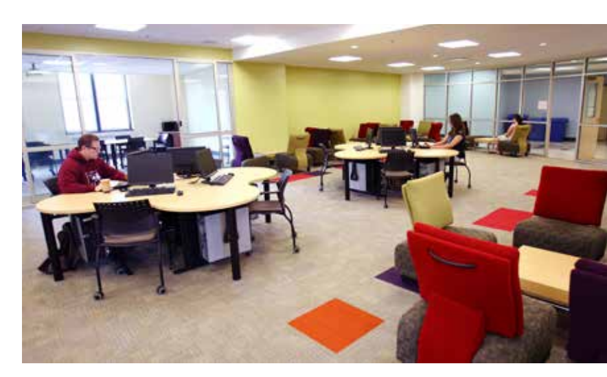
McNally Arts Commons, heart of the Faculty of Arts McNally Building, 2nd floor