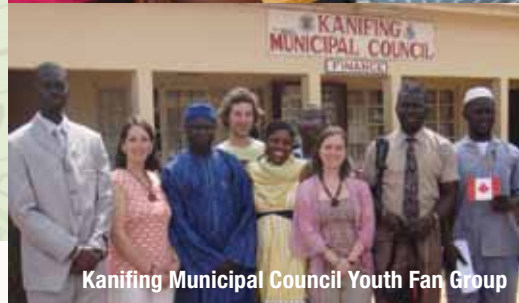
Kanifing Municipal Council Youth Fan Group